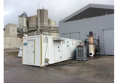
Methanation pilot plant at Köping, Sweden.

Biogas facilities produce the renewable gas mainly by fermenting biological waste. In countries with a large forestry sector, such as Finland or Sweden, there is a high potential for the production of SNG from waste wood. By means of biomass gasification, a synthesis gas is produced, which mainly consists of hydrogen, carbon monoxide, and carbon dioxide. This mix can then be converted into high-quality methane by methanation. Researchers of KIT's Engler-Bunte Institute and the DVGW Research Centre have now successfully tested a highly efficient methanation process for a period of several weeks in the city of Köping, Sweden.